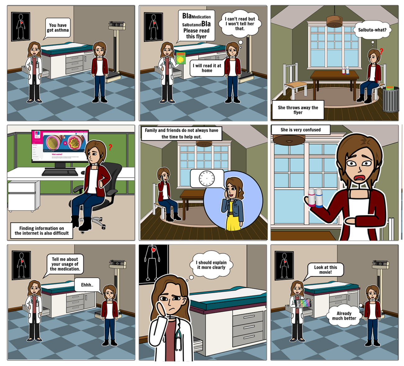
Figure 2. An example storyboard used during the co-constructing story sessions (translated into English).

Two participants with asthma and LHL participated in the co-constructing stories sessions. The sessions took place at the facilities where the participants worked, lasted approximately 1 hour, and were audiorecorded. Observations and impressions about reasons for nonadherence and the co-constructed stories were collected in the form of a written report after the sessions. Using the storyboards, we asked nondirective questions such