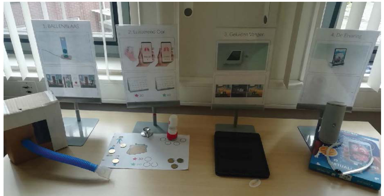
Figure 3. Low-fidelity prototypes and visual explainers positioned in an exhibition-style setup during the evaluation.

included were (1) a smart wheeze-detecting sensor to objectively monitor asthma state, (2) an immersive experience using augmented reality to engage the user in the monitoring process, (3) a playful spirometer, and (4) a wake-up experience, displaying the result of nocturnal asthma symptoms. We translated the concepts into low-fidelity prototypes to explore their feasibility and facilitate the upcoming feedback session with the participants. The prototypes consisted of cardboard mock-ups, physical artifacts, and off-the-shelf products, such as an augmented reality T-shirt with a projection of the lungs (Figure 3).